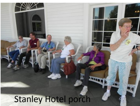
Stanley Hotel porch