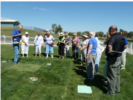
Conservation gardens at Northern Water in Berthoud