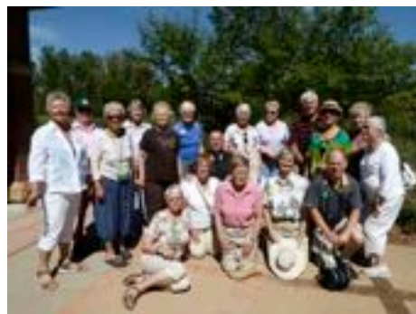
Northern Colorado hosts with guests from Lincoln, Des Moines, and Houston