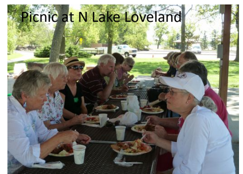
Picnic at N Lake Loveland